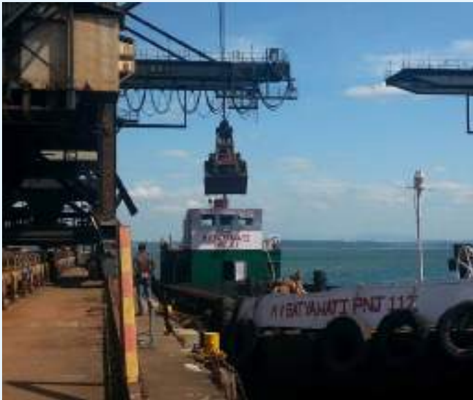
Barge Unloading operations commence at MOHP