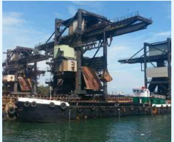
Barge Unloading operations commence at MOHP