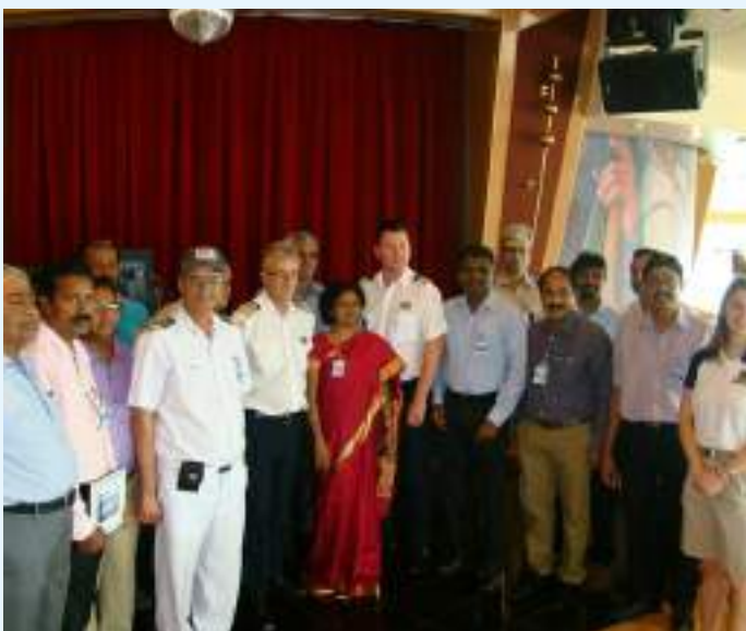
Chairman & senior port executives visit M.V. EXPLORER OF THE SEAS